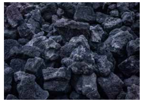
100% recycled scrap iron as a raw material