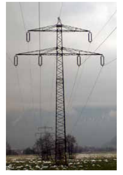
Narrow structures with special requirements for foundations and wind loads