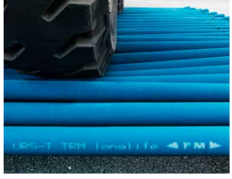
Type testing in the laboratory on the works premises.