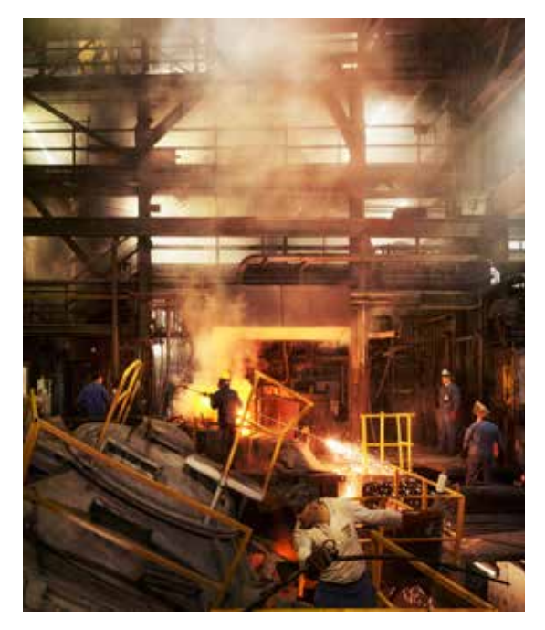
Cupola furnace with channel furnace in the foreground