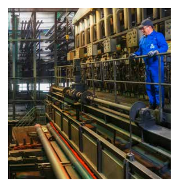
Annealing furnace to improve material properties