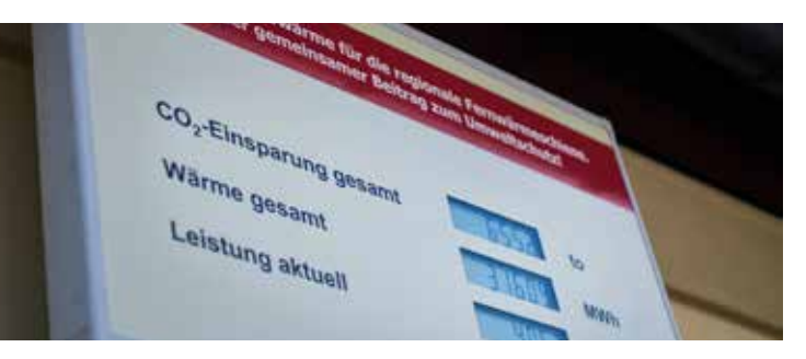
Waste heat fed into the regional district heating network