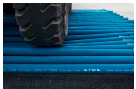
Impressive properties of ductile iron