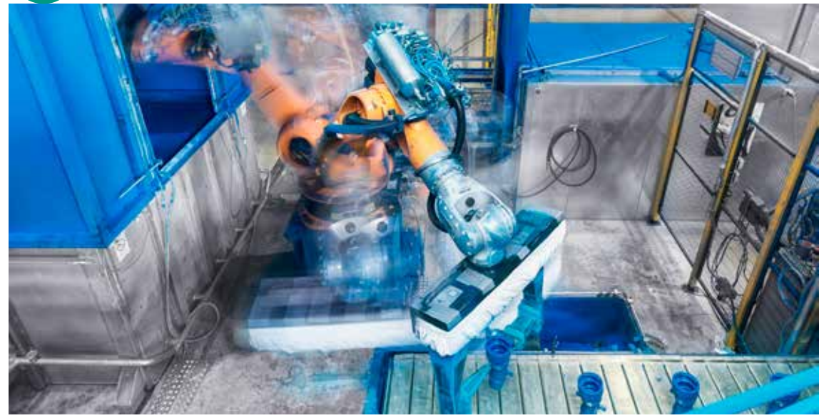
Coating robots in use at the location Hall location in Tyrol