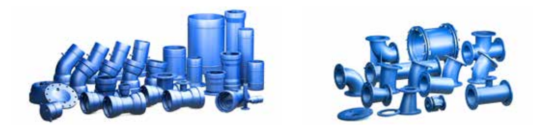
Extensive range of fittings