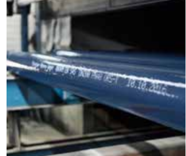
Label at the end of the production line